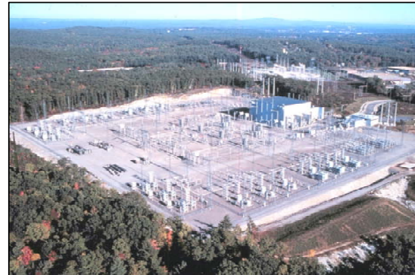
Sandy Pond Project