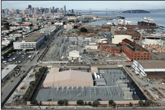
Trans Bay Cable Project