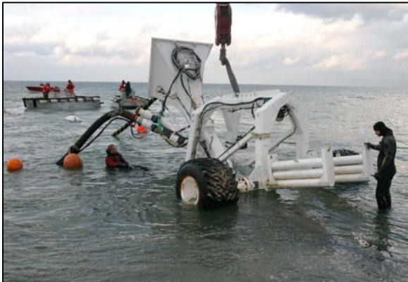
Nantucket Cable Project