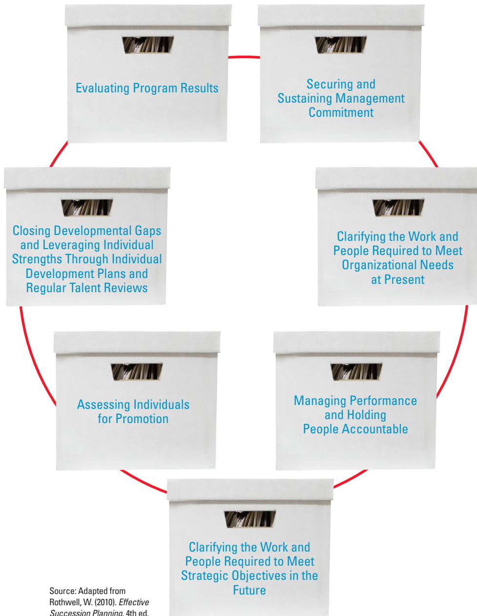
Figure 1 | A Strategic Model to Guide Management Succession Planning

road map to long-term implementation. This is important, because approximately 70 percent of all succession planning programs fail in the long term due to implementation problems.